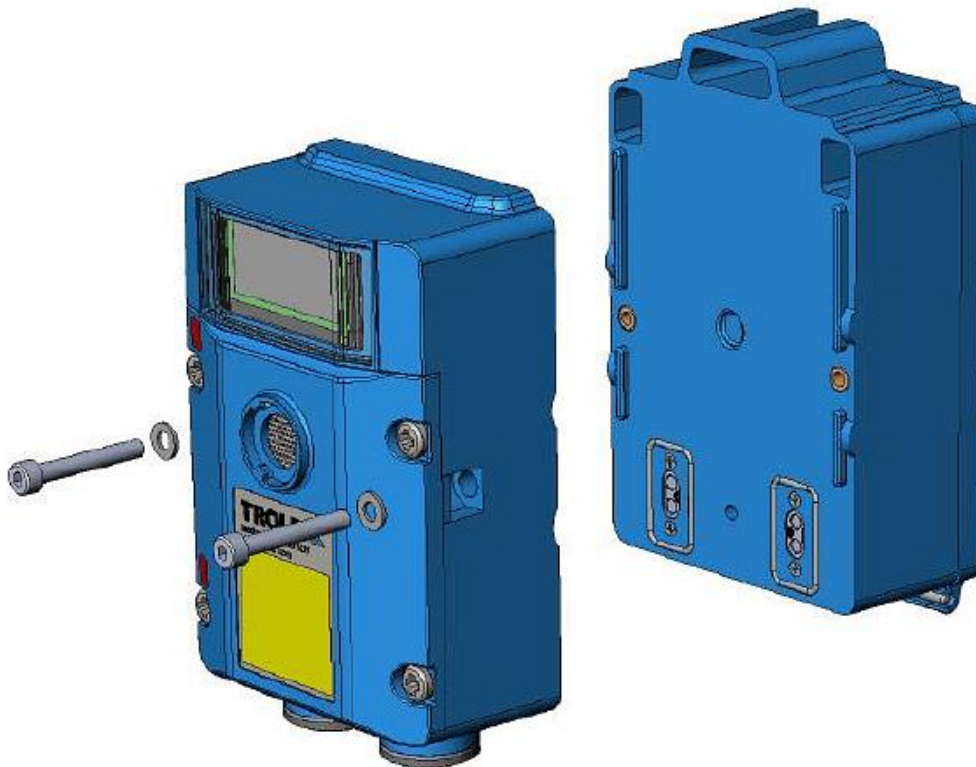
Figure # 2.1: Sentro Wireless (Battery Operated Version)

The Trolex Sentro Wireless Gas Detector (Sentro) is designed for use in underground gassy mines to provide air-monitoring in a fixed location. The Sentro Wireless is powered with an external battery pack that connects to the main enclosure at screw terminals 4, 5 on the Output Board. The Sentro is a single channel unit designed to monitor one of the following gases Methane, Carbon Dioxide, High Level Carbon Monoxide, Low level Carbon Monoxide, Oxygen and various other toxic gas levels. The levels measured are displayed on the gas monitor LCD. A visual alarm can be set to trigger at user adjustable set-points. The system is used to measure ambient gas levels by diffusion.