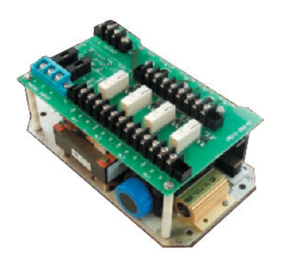
TX6635 • TX6636 Open chassis