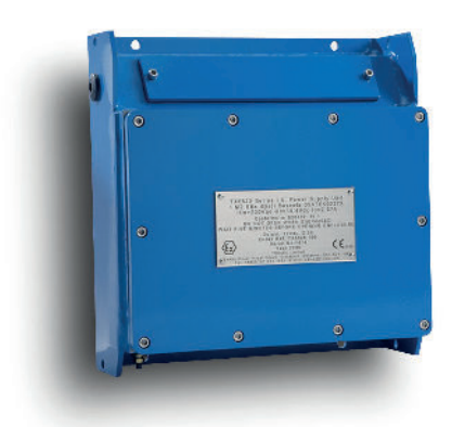
TX6626 With Ex d housing