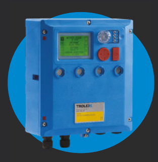
TX9165 SENTRO 8