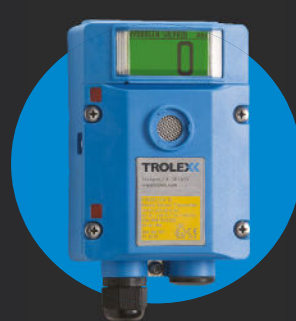
TX6351-2 SENTRO 1