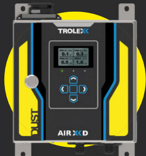
TX8005 AIR XD DUST MONITOR