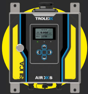
TX8100 AIR XS SILICA MONITOR

Timeco supply a variety of Trolex gas monitoring systems, including TX9165 Sentro 8 and TX6351-2 Sentro 1 Universal Gas Detector designed to perform in the most hazardous working environments, as well as the highly robust TX6383 Flammable Gas Detector . To protect workers from a range of hazardous dusts, Timeco supply ground-breaking Trolex particulate monitors, such as the AIR XD Group I IS Dust Monitor , designed to monitor all types of dust in ATEX atmospheres, and the AIR XS Silica Monitor , which detects levels of RCS in tunnelling environments.