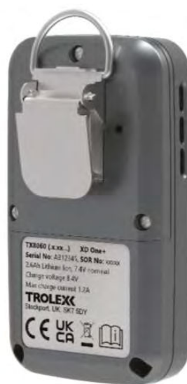
XD1 + with alligator clip.

The XD1 + is supplied with an alligator mounting clip as standard. A Klick Fast stud is available to allow the XD1 + to be compatible with a range of wearable, wall and pole fixing kits (see product data sheet for additional fixing kit details).